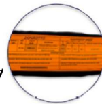
Traceable ID Tag