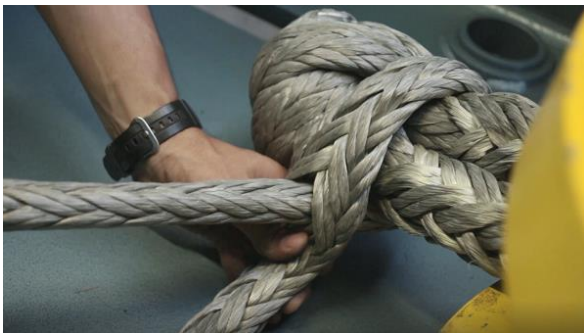
Step 7: Ensure soft shackle eye is tightened securely behind stopper knot