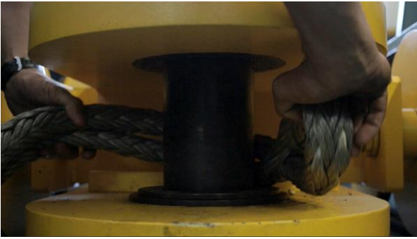
Step 2: Pass eye end of soft shackle around anchor/ recovery point