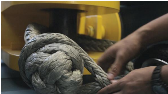
Step 6: Tighten soft shackle eye behind stopper knot