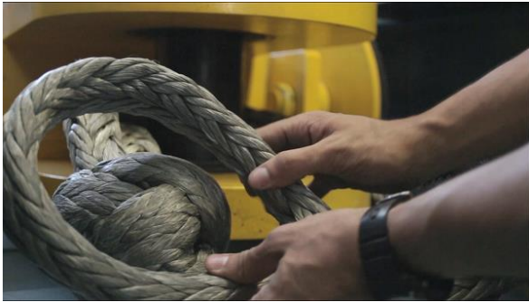
Step 5: Place soft shackle eye over stopper knot