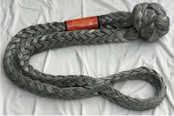
Step 1: Open soft shackle