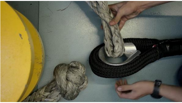
Step 3: Pass eye end of soft shackle through tow strop eye or tow rope eye