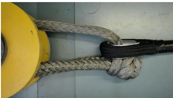
Step 9: Ensure stopper knot is positioned correctly before applying load